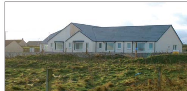
KALISGARTH PICTURED FROM THE EAST

THE CREATION of a Care Centre has been a key goal for the Development Trust from its outset. We are delighted the vision is now nearing fruition in the shape of “Kalisgarth”.