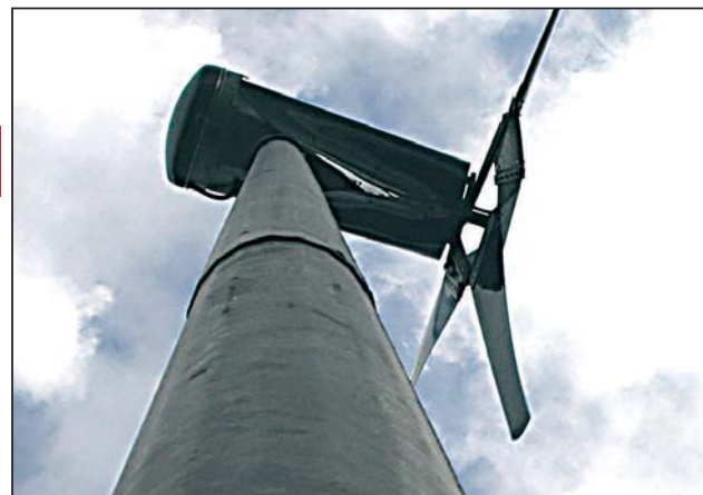
THE HOFN WINDMILL