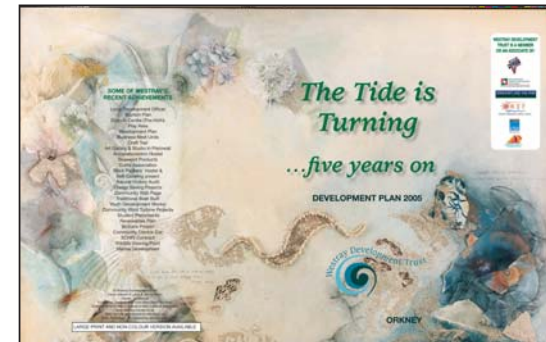
THE NEW DEVELOPMENT PLAN

to have the very capable and enthusiastic Colin Risbridger employed to work specifically on Renewable Energy (RE) projects, but due to the fact he is so enthusiastic there is so much going on it has not meant less work for me. The work we have been doing in the RE sector has